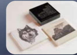
Marble & Tile Engraving