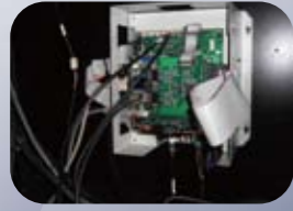
Upgraded Engraving Controller