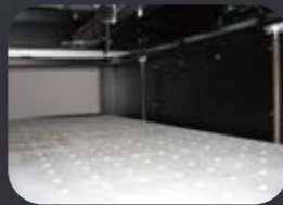
Motorized Working Table