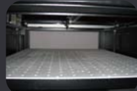
Pass Through Design