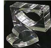
Thick Acrylic cutting