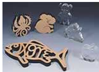
Thick MDF board